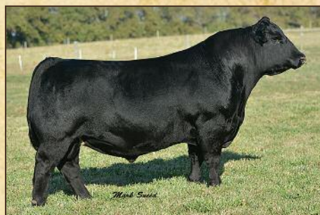
PVF Insight 0129