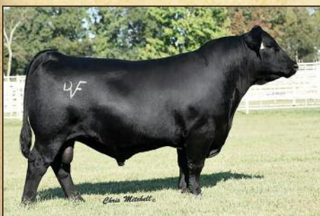
Deer Valley Wall Street