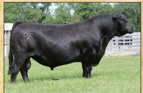
Deer Valley Growth Fund