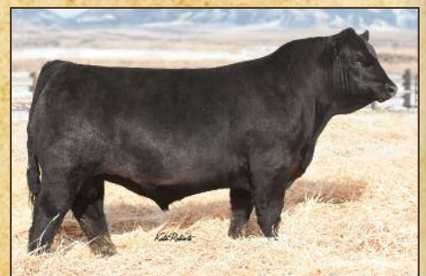
Koch Big Timber