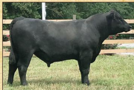
MM Confidence Plus 8103